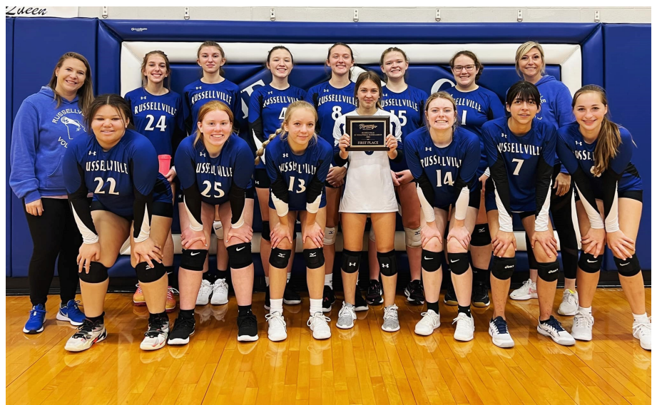
Lady Indians JV Volleyball took 1st place in the Russellville JV tournament on September 25th! Congratulations, ladies!