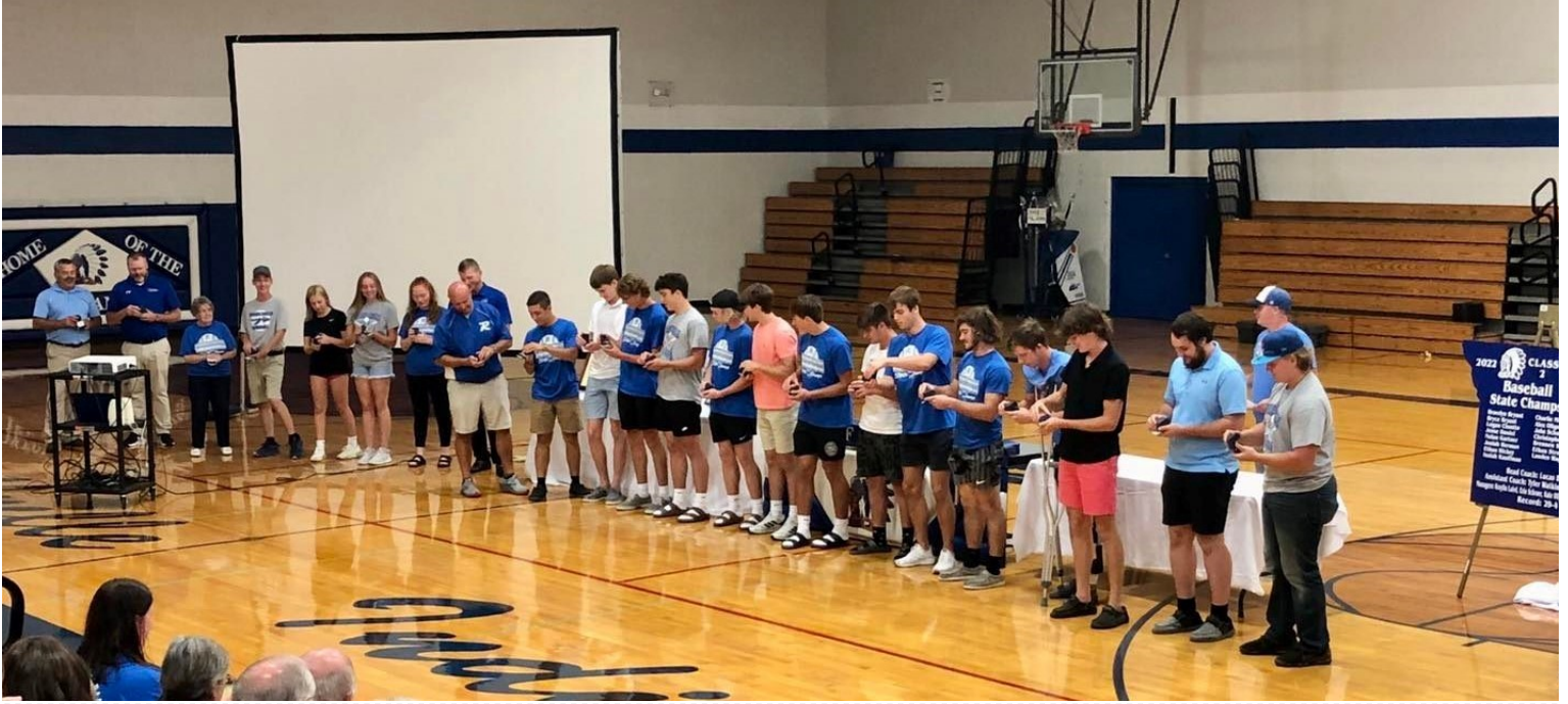
Congratulations to our state championship baseball team on their ring ceremony, patches, state recognitions, and support from a wonderful community.