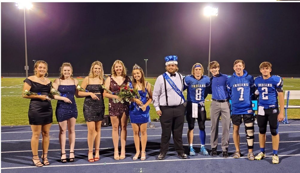
2022 Homecoming Candidates (left to right)